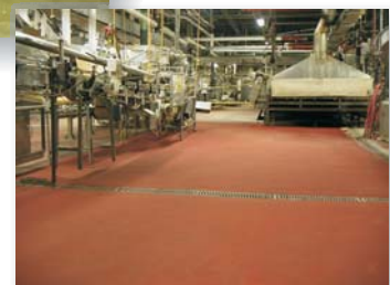
Floor restoration - before & after

Inscan Contractors (Ontario) Inc. Specialty Contracting Services Division 212 Wyecroft Rd., Unit 33, Oakville, ON L6K 3T9 Ph: (905) 842-5075 Fx: (905) 842-5895