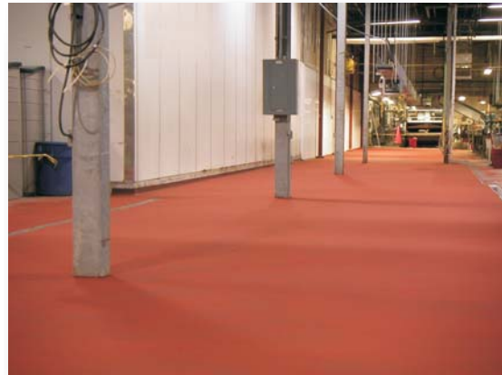
Extended packaging line flooring

Bick's needed a protective flooring system that would stand up to the organic acids, thermal shock, and heavy tow motor traffic; while at the same time provide a hygienic, cleanable surface with the required slip resistance for employees working in the wet areas.